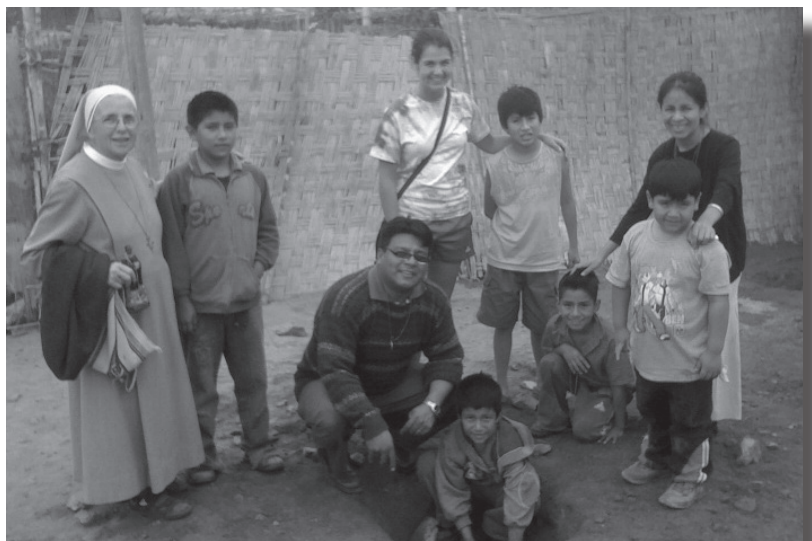
Friends from our sister parish in Peru